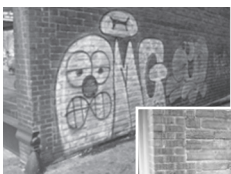
Before & after the event

To volunteer for similar opportunities in your neighborhood, contact Alison Wallisch at 503-823-4265, Alison@nwnw.org .