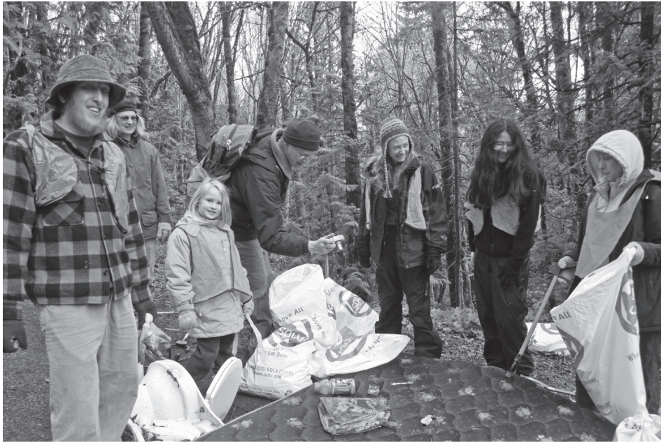
Over 100 volunteers celebrated Earth Day by cleaning the roadsides of Forest Park, Sylvan-Highlands, and Linnton on Saturdays, April 19 th and 26 th. Thanks to all of our volunteers. Shown above are some volunteers from the Forest Park Clean Up.