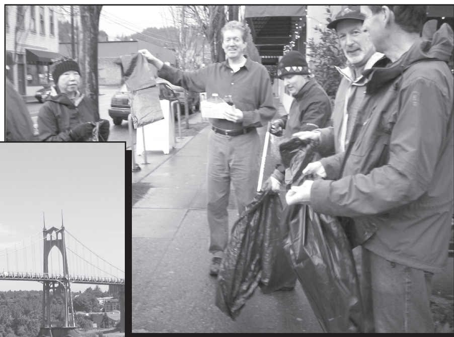
Above: Clean-Up Volunteers Left: St. Johns Bridge from NW Portland