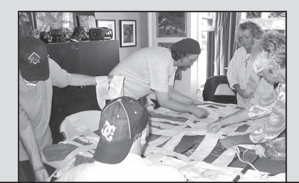
Community Craft Class at Julia West House funded from the 2008-09 Neighbors West-Northwest Neighborhood Small Grant Program.

Submit applications for up to $5000 to Neighbors West-Northwest, 2257 NW Raleigh St., Portland, OR 97210 by 2:00 p.m. on November 2, 2009. Please contact Angela Southwick with any questions: 503 823-4211, angela@nwnw.org.